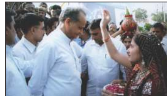
Chief Minister of Rajasthan Shri Ashok Gehlot on Convocation and Award Ceremony of the College Achievers.