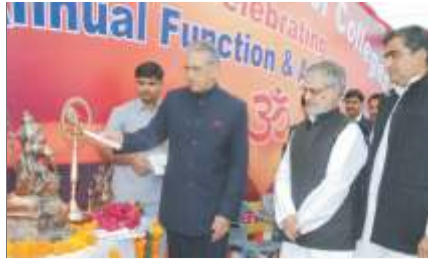
Shri B. L. Joshi , Hon'ble Governor of Uttar Pradesh Shri CP Joshi , Speaker of Rajasthan Legislative Assembly.