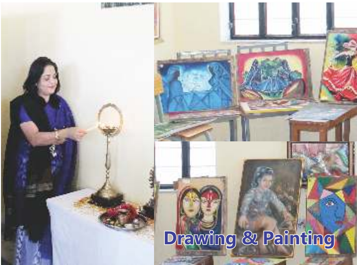
Drawing & Painting