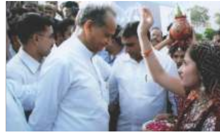
Shri Ashok Gehlot Hon'ble Chief Minister of Rajasthan