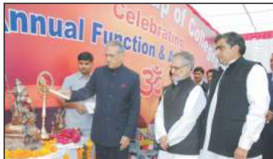
Hon'ble Governor of Uttar Pradesh Shri B.L. Joshi on 5th Annual Function with Cabinet Minister Shri C.P. Joshi (Minister for Road Transport and Highways)