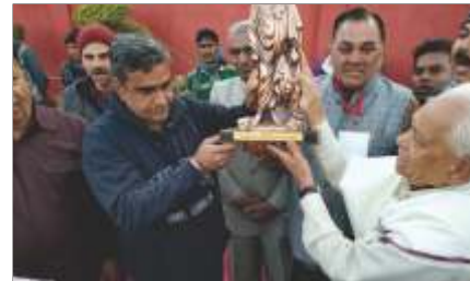
Dr. S.N. Subba Rao Social Reformer, Great Gandhian and Founder of National Youth Project of India