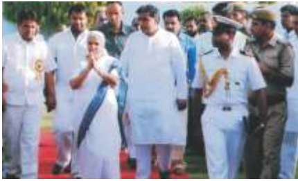
Smt. Kamala Hon'ble Governor of Gujarat