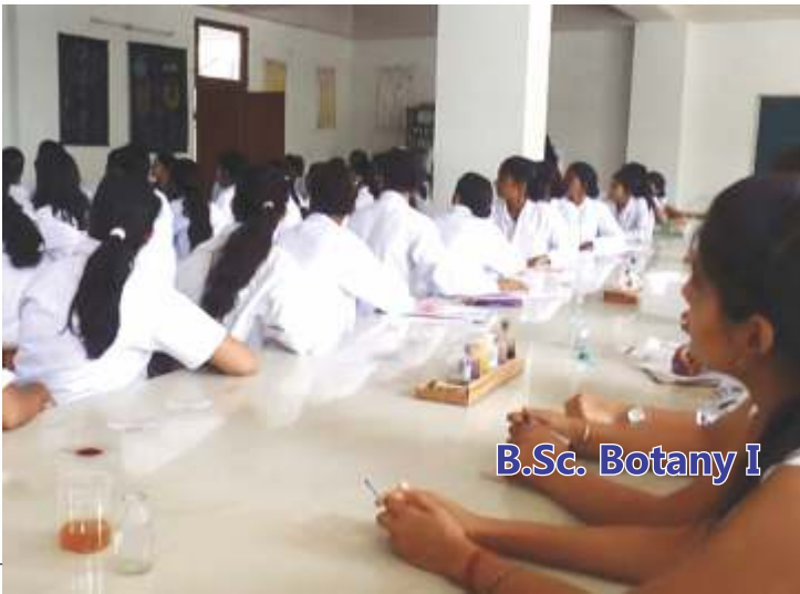
B.Sc. Botany I