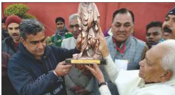
Dr. S.N. Subba Rao,

popularly known as Bhajji. A well known Gandhian and the founder of the National Youth Project of India, dedicated his life to Gandhian ideals. He has been associated with several organisations, including the Student Congress and the Rashtra Seva Dal. He is famous for conducting the Youth leadership camps, employment generation camps and programmes related to empowerment of rural people and students. In this series Dr. Subba Rao conducted a camp in our campus, here he conveyed the message of selfless service to the community and motivated our students and lecturers with gandhian perspective and moral values.