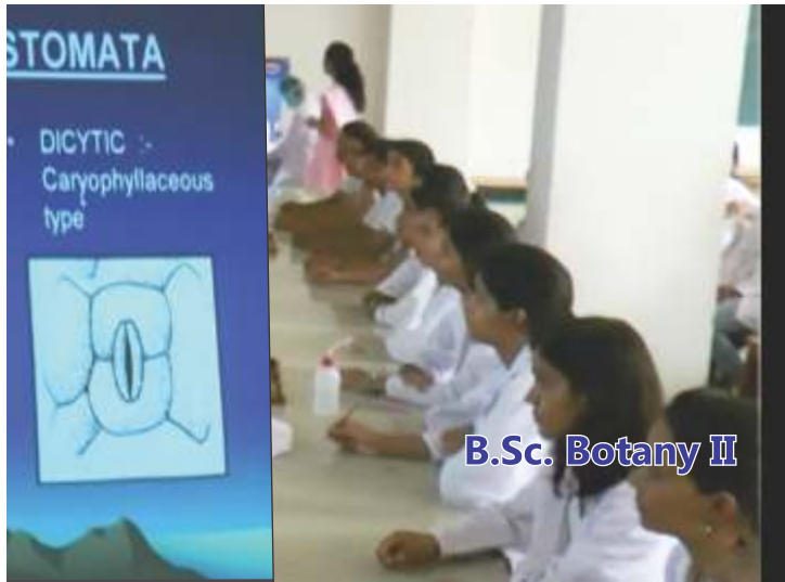
B.Sc. Botany II