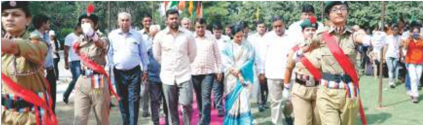
Shri Ashok Chandna Minister, Youth Affairs and Sports Department (Independent Charge) Govt. Of Rajasthan