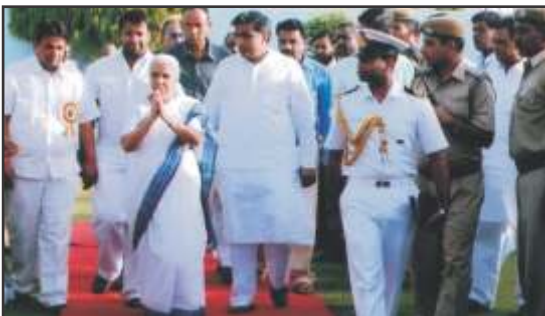
Hon'ble Governor of Gujarat Smt. Kamala on the 4th Annual Day of the College