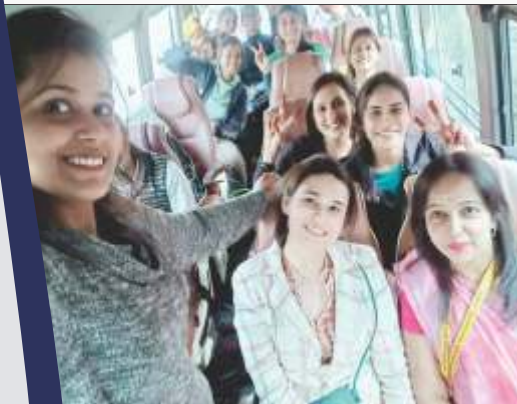
COLLEGE TOUR 1st