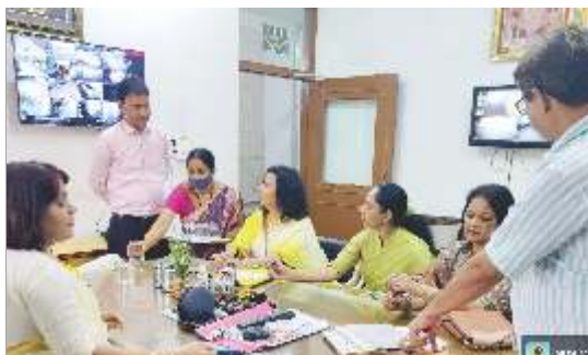
DEPARTMENT OF EXCELLENCY AND HOSPITALITY