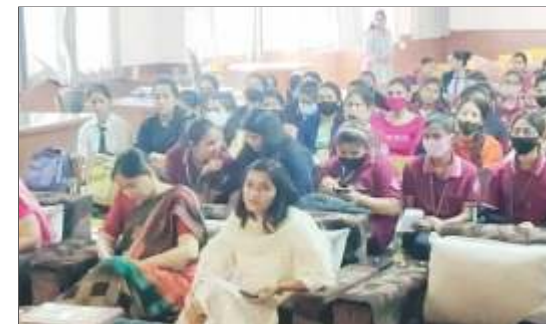
DEPARTMENT OF ENGLISH