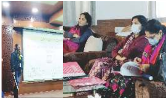
DEPARTMENT OF CHEMISTRY