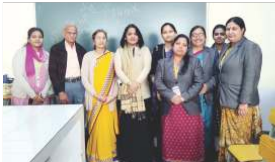
DEPARTMENT OF HOME SCIENCE