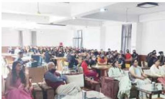
DEPARTMENT OF ZOOLOGY