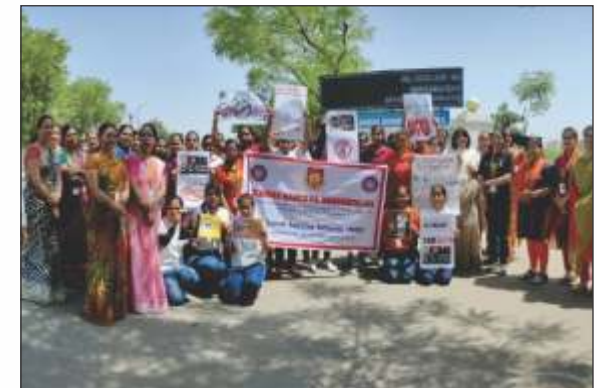
RALLY AGAINST SMOKING