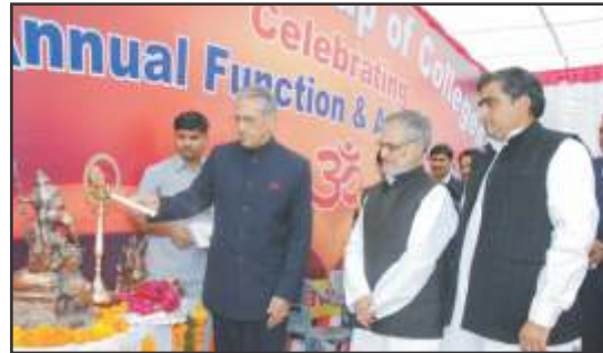
Hon'ble Governor of Uttar Pradesh Shri B.L. Joshi on 5th Annual Function with Cabinet Minister Shri C.P. Joshi (Minister for Road Transport and Highways)