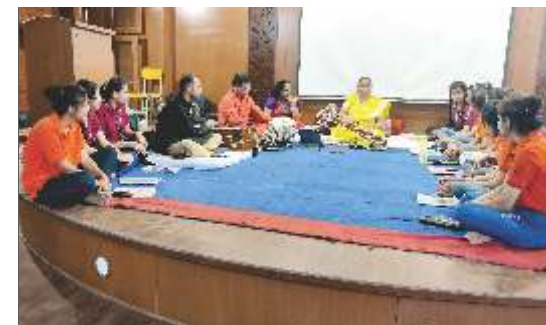
DEPARTMENT OF MUSIC