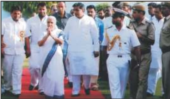
Hon'ble Governor of Gujarat Smt. Kamala on the 4th Annual Day of the College