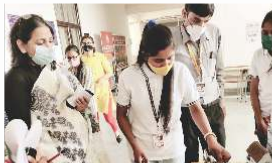
DEPARTMENT OF PHYSICS