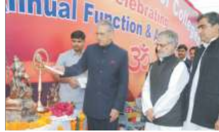
Shri B. L. Joshi , Hon'ble Governor of Uttar Pradesh Shri CP Joshi , Speaker of Rajasthan Legislative Assembly.