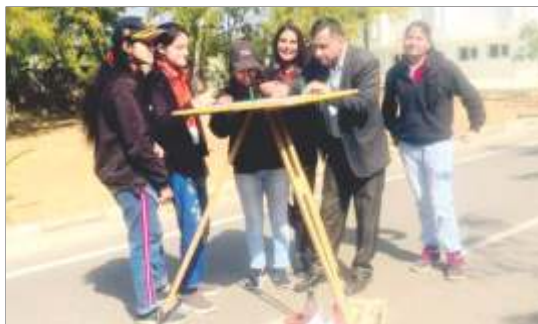
DEPARTMENT OF GEOGRAPHY