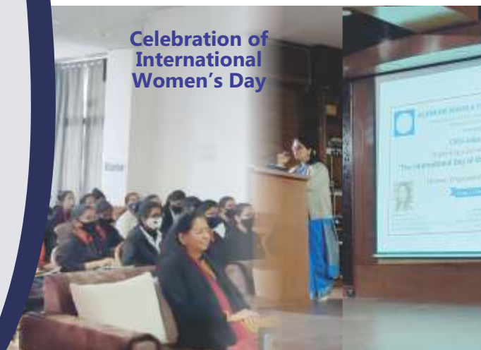
Celebration of International Women's Day