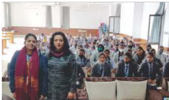
DEPARTMENT OF BCA