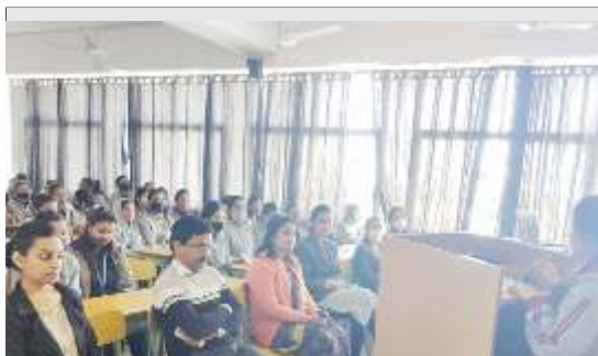
DEPARTMENT OF COMMERCE