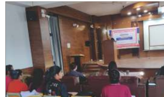
DEPARTMENT OF ECONOMICS