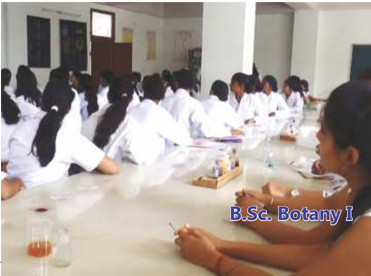
B.Sc. Botany I