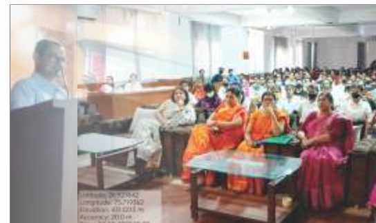
DEPARTMENT OF BOTANY