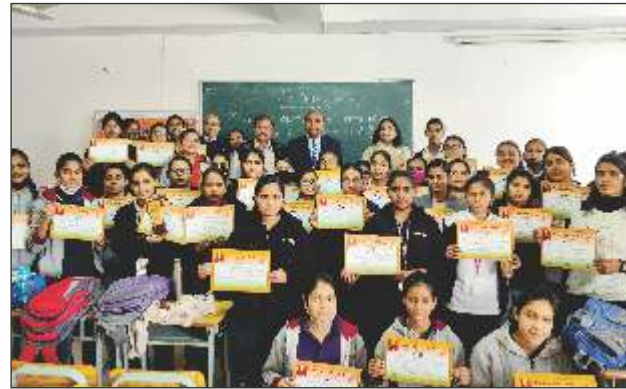
QUIZ ORGANISED BY BHART VIKAS PARISHAD