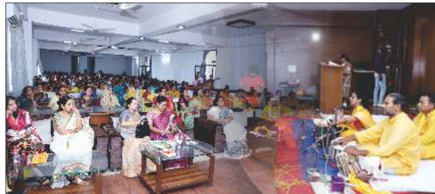
SPIRITUAL WORKSHOP ORGANISED BY ALL INDIA GAYATRI PARIVAR