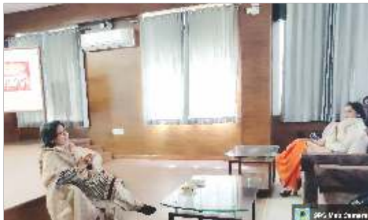
DEPARTMENT OF PSYCHOLOGY