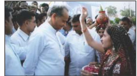
Chief Minister of Rajasthan Shri Ashok Gehlot on Convocation and Award Ceremony of the College Achievers.