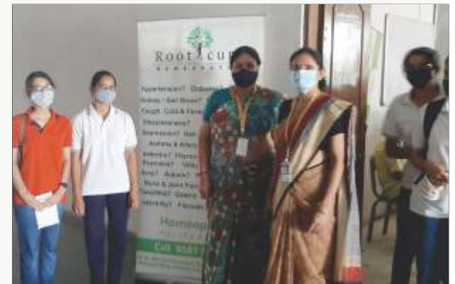
ROOT CARE HOMEOPATHY VISIT