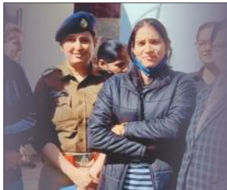
WORKSHOP: TRAFFIC RULES