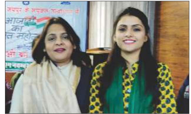
PRASAR BHARTI WORKSHOP