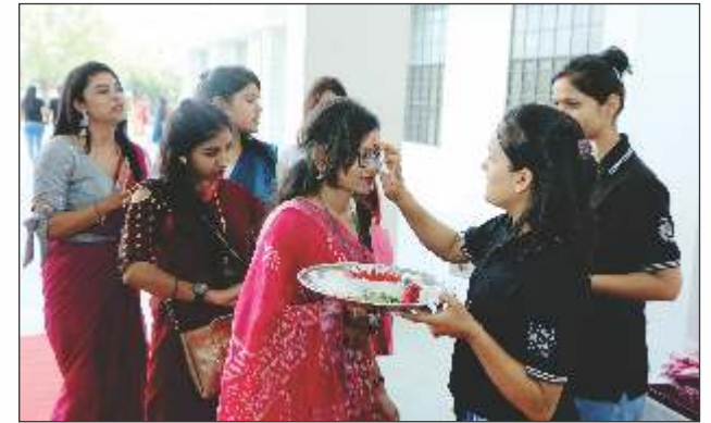
ALUMNI MEET 2022