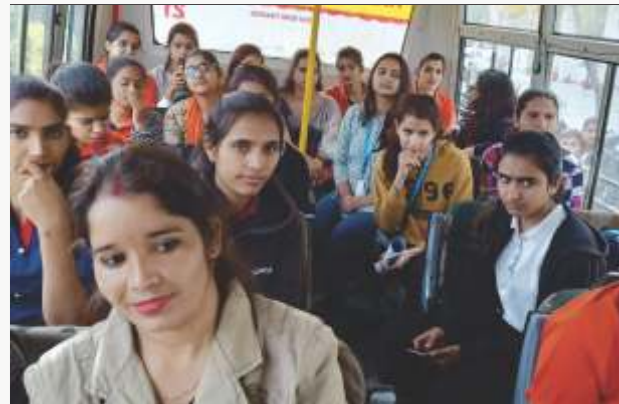
COLLEGE TOUR 2nd