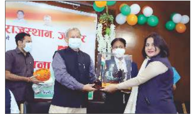
PRIZE DISTRIBUTION 2022