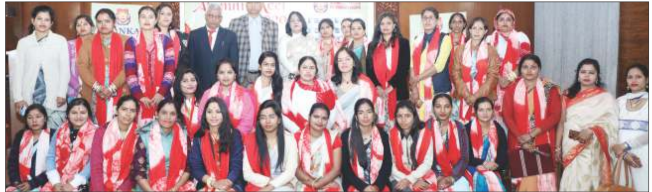
ALUMNI MEET 2020