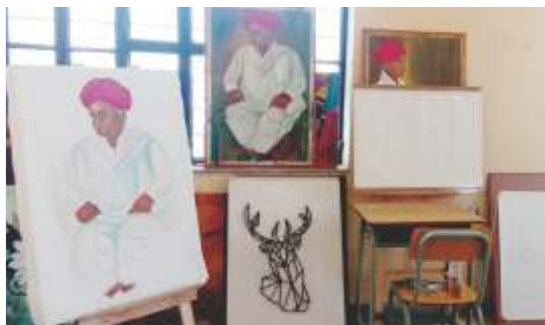
DEPARTMENT OF DRAWING AND PAINTING