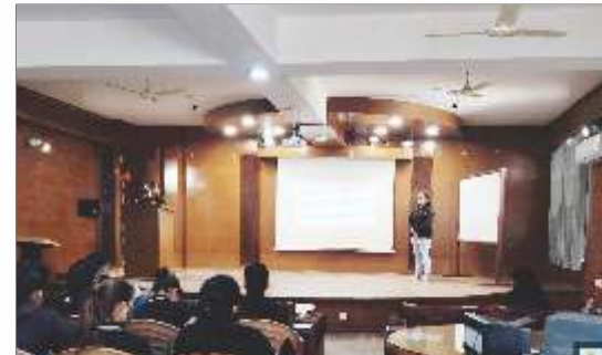
DEPARTMENT OF ZOOLOGY